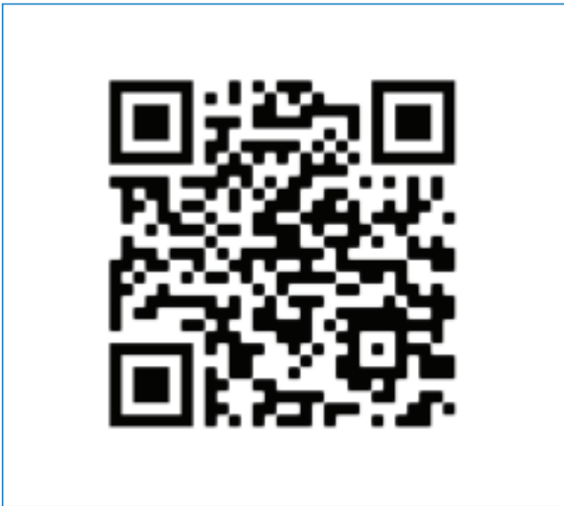
Figure 2. QR code for Physics 4 All: Labs for PhET Simulations

Of course, the journey is not over; after all, a book doesn't sell itself. Now, I am off to conferences, thanks again to the generosity of the Knowles Teacher Initiative. I am happy to report that as of March, interest in my book has grown both through Amazon and on Teachers Pay Teachers. I hope the story of my experience encourages other teacher-authorpreneurs to pursue their own writing and publishing goals. Take a weekend, even a personal day, to map out the steps you need to take and reach out to your own professional community for support. Will it be easy? No. But will it be worth it? Yes.