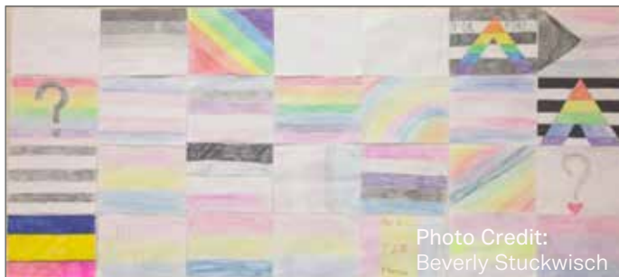
Figure 1. Compilation pride flag colored by GSA students.

Because of the issues the previous year, I took a photo of the finished flag (Figure 1) and sent it to the principal for approval prior to hanging. Once we had that approval, it went up in a large blank space of the math hallway (somewhere we knew all students would pass at some point in their day). Two days later, my colleague and I were asked to meet with the principal during our lunch period. I felt sick to my stomach because I knew what the outcome of that meeting would be—the flag was coming down.