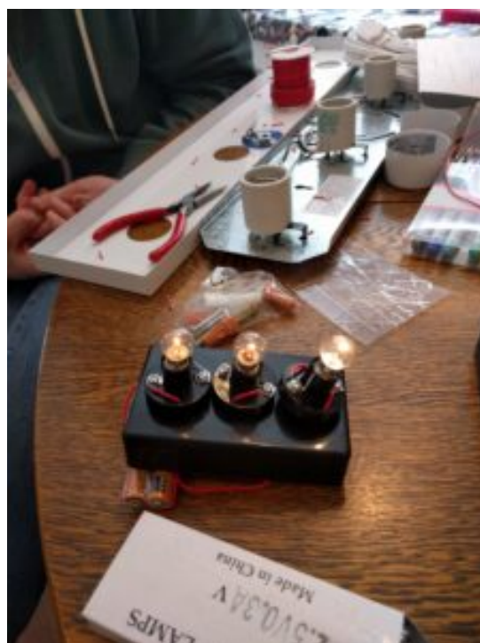
Figure 3. Testing a mystery circuit during one of our meetings.

We also worked on other electricity ideas, including building a set of mystery circuit boxes with hidden wiring connecting exposed bulbs in different combinations of series or parallel connections (Figure 3). Marna ended up building a set of large-scale circuits to use as a class demonstration for students to discuss and write about in pairs, and Shannon used a smaller-scale version in a station activity.