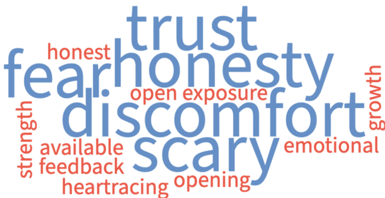
One-Word Participant Associations with the Word Vulnerability

Note. This figure was made with Poll Everywhere during our presentation.