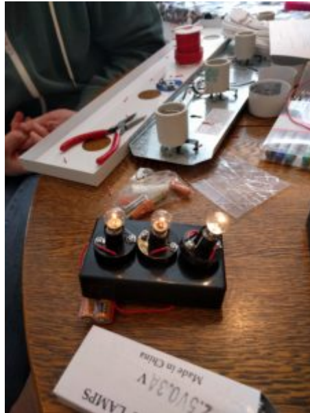
Figure 3. Testing a mystery circuit during one of our meetings.

We prototyped various smaller activities throughout the year, including: