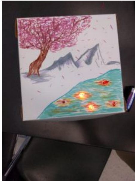
Figure 2. A student prototype of their electric art project completed in a small cardboard box (above) and a final project completed on a canvas with lights not yet installed (below).