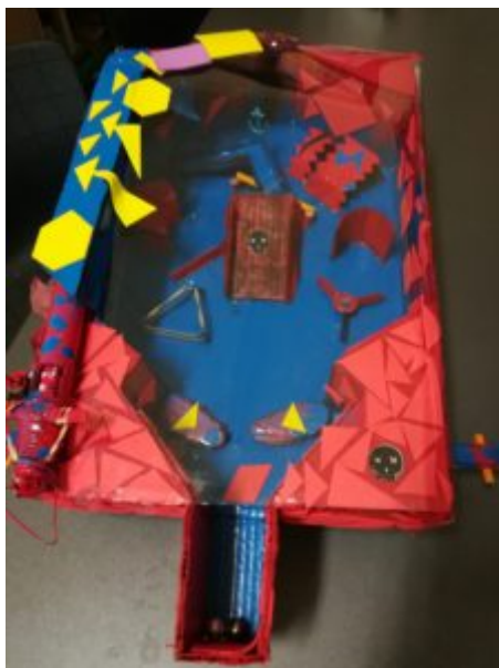
Figure 1. A cardboard pinball machine constructed by a student.

Marna incorporated a set of student-chosen science fair investigations about the forces in rubber bands, angles of ramp elevation, and friction on different surfaces.