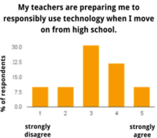
Figure 2: Students don't feel strongly that their teachers are preparing them to responsibly use technology in the future

classroom. Surprisingly, they were quite honest and forthcoming. The vast majority of students recognized that they would need to be able to master appropriate technology use for their future careers (Figure 1), yet did not feel strongly that their teachers were properly preparing them for that inevitability (Figure 2). One student recognized ways in which technology could make his work easier, saying, “Reading from a book requires far more time to find the information you need. With a computer, you can simply type what you need in the search bar and you get all the information that you need.” Other students expressed that they didn’t particularly enjoy working on the computer, especially when it came to reading, saying things like, “I am less distracted when I read actual books.” Students were generally upfront about the computer acting as a distraction to their learning, with 78.4% of students stating that they found themselves distracted by games and social media at least some of the time (Figure 3).