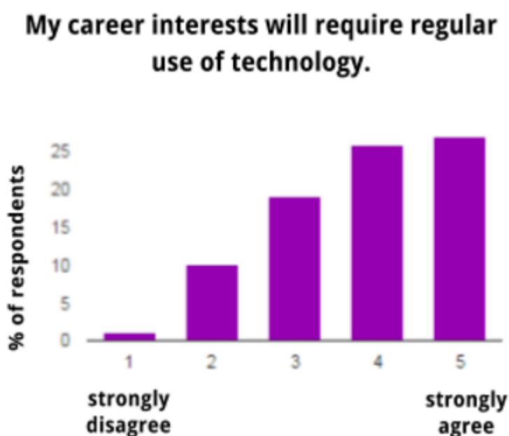
Figure 1: Students agree that technology will be important to future careers.

Chromebooks. Additionally, since this was my first experience in a rural district, I hadn't realized how uncommon it was for rural students to have internet at home (or anywhere nearby). Because of this, those students pretty much only interacted with their devices at school. For some of them, their Chromebook was the first computer they had ever used. They were still struggling to learn how to type and how to use Google and I was expecting them to conduct research, write a response, and turn it in—all electronically and all in one period. It was just too much, too fast.