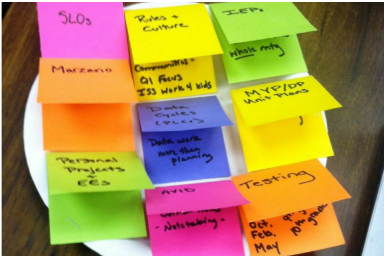
Figure 1: A representative depiction of demands on teacher time.

To represent the demands on teacher time, I took a paper plate and stapled little colorful pieces of paper to the plate. On each piece of paper I wrote a single focus for the year. I meant for this plate to be a creative way to communicate with my department about the many things “on our plate” this year. The plate became a tangible way to discuss threats to morale throughout the year. Each thing on the plate, taken in isolation, is something that could be good for student learning. However, the plate as a whole was so full that each component lost its power. Plus, teachers had little power in choosing what was on the plate, and this lack of autonomy added to overwhelming feelings of discouragement. Morale in my department was crushed by heavy demands on teacher time, coupled with a feeling that teachers’ strengths went unnoticed.