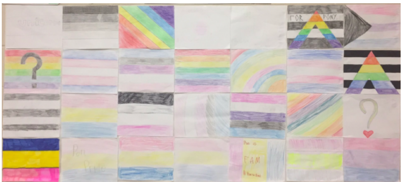
Figure 1. Compilation pride flag colored by GSA students.

Because of the issues the previous year, I took a photo of the finished flag (Figure 1) and sent it to the principal for approval prior to hanging. Once we had that approval, it went up in a large blank space of the math hallway (somewhere we knew all students would pass at some point in their day). Two days later, my colleague and I were asked to meet with the principal during our lunch period. I felt sick to my stomach because I knew what the outcome of that meeting would be—the flag was coming down.