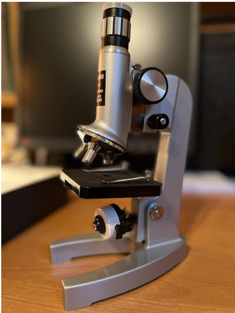
Childhood Microscope from Sears