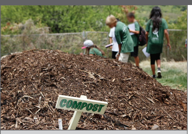
SEEQS students explore an organic garden to observe and practice sustainable food production

important in Hawaiian culture; others may choose to build and maintain a small organic garden plot on the school grounds. Some, like Kai, may close the loop by maintaining a worm bin of their own to turn food waste back into nutrients for the soil.